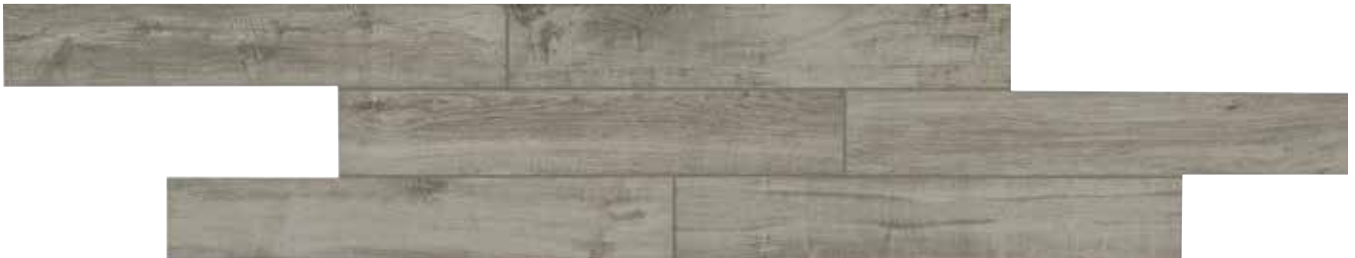
ASH RIVER CW99