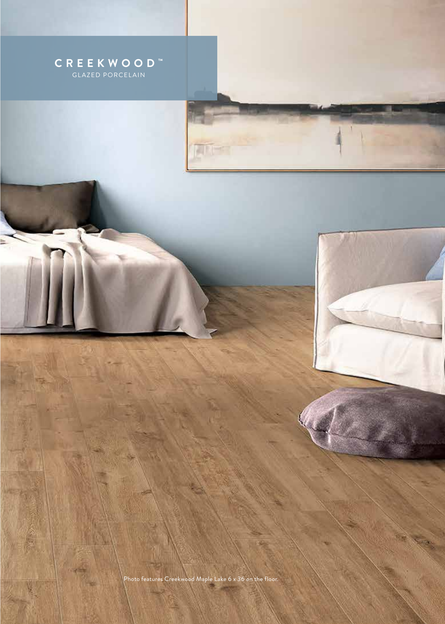
Photo features Creekwood Maple Lake 6 x 36 on the floor.