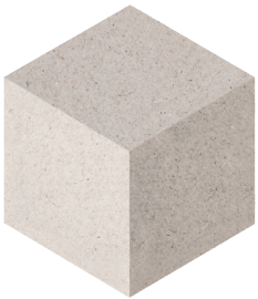
PAPER BLOC CF20