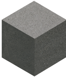
CARBON BLOC CF21

VISIT AMERICANOLEAN.COM/WHYTILE FOR A COMPLETE LIST OF QUALIFICATIONS AND EXCLUSIONS.