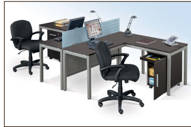
Compact L-Desk Set (2)