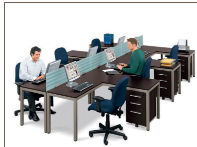
Compact L-Desk Set (6)