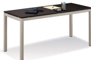
48"x24" Table Desk 60"x24" Table Desk 72"x20" Table Desk 72"x24" Table Desk 72"x30" Table Desk