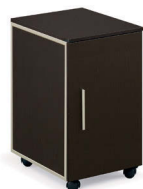
Mobile Storage Pedestal