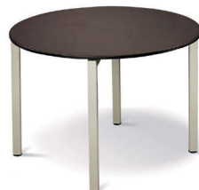
42" Round Conference Table