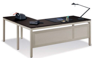
Compact L-Desk 60"x60" Reversible L-Desk 72"x72" Executive L-Desk 78"x72"