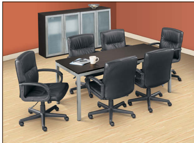
Small Conference Room Set w/ Storage