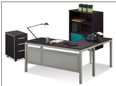
Compact L-Desk with Storage Set