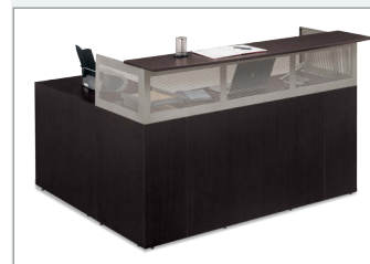
Reception L-Desk (right return) Reception L-Desk (left return)