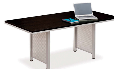
6' Conference Table 8' Conference Table