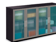
Counter Height Credenza w/ Glass Doors