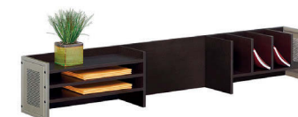
60" Hutch Organizer 72" Hutch Organizer