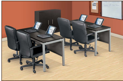
Training Room Set