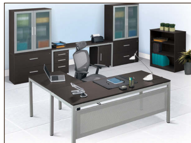
Executive Office Suite