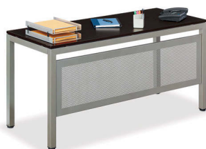
48"x24" Table Desk w/ Modesty Panel 60"x24" Table Desk w/ Modesty Panel 72"x24" Table Desk w/ Modesty Panel 72"x30" Table Desk w/ Modesty Panel