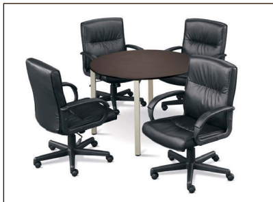
Round Conference Room Set