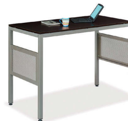
Standing Height Table 48"x24" Standing Height Table 60"x30"