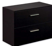
Two-Drawer Lateral File