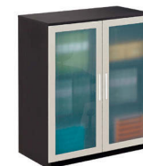
Storage Cabinet w/ Glass Doors