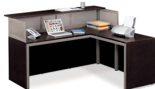
Reception L-Desk (right return) Reception L-Desk (left return)