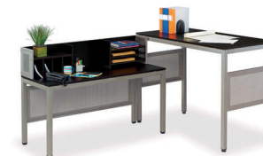
Standing Height Table L-Desk