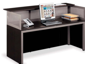
Standard Reception Station