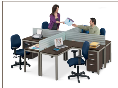
Compact L-Desk Set (4)