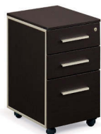
Mobile File Pedestal