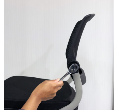
Use Size 10 socket wrench to adjust pivot: tighten to have less recline; loosen to have more recline.