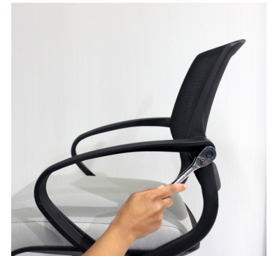
Use Size 10 socket wrench to adjust pivot: tighten to have less recline; loosen to have more recline.