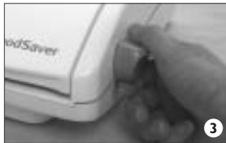
Close and Latch Lid