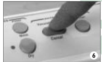
Press Vacuum & Seal Button