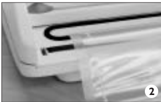
Place Bag in Vacuum Channel