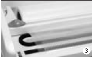
Place Bag on Sealing Strip