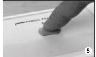
Press Seal Button