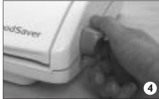
Close and Latch Lid