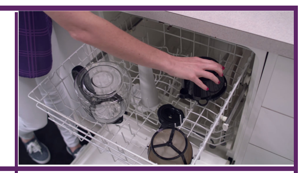
Tip #2: Clean with White Vinegar

Remove the filter basket and carafe and wash them in a solution of hot water and mild liquid soap. Alternately you CAN place glass carafes & lids, filter baskets and permanent filters in the top rack of your dishwasher.