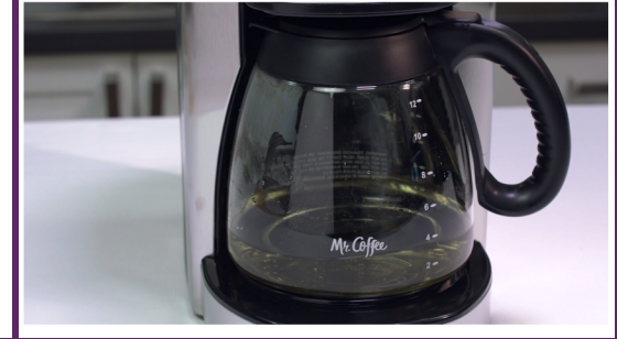
Tip #5: Brew Clean Water Through

After 30 minutes, your coffeemaker will brew the remainder of the vinegar. When complete, the CLEAN light will turn off and your coffeemaker will turn off. Discard the vinegar and rinse the carafe thoroughly with clean water.