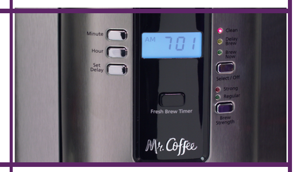
Tip #4: After 30min. Brew 4th Cup

Press the Select/Off button until the red CLEAN indicator light turns on. The entire cycle will take 45-60 min. During the cleaning your coffeemaker will slow brew the. 3 cups of vinegar and then pause for 30min.