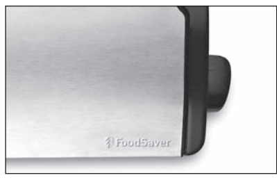
Close and Latch Lid