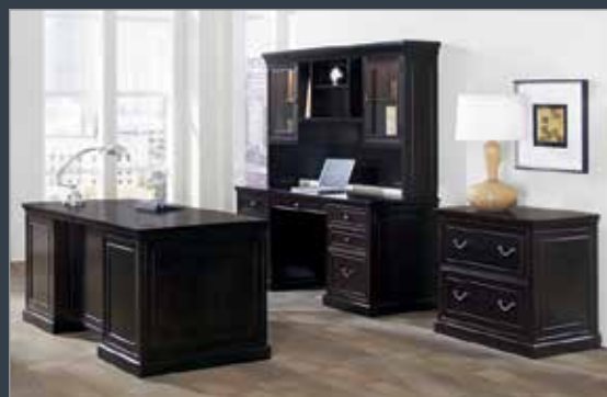
Martin — Fulton Collection

From the ordering process to space planning and installation, we'll be there with you every step of the way, with furniture that works and people who care.