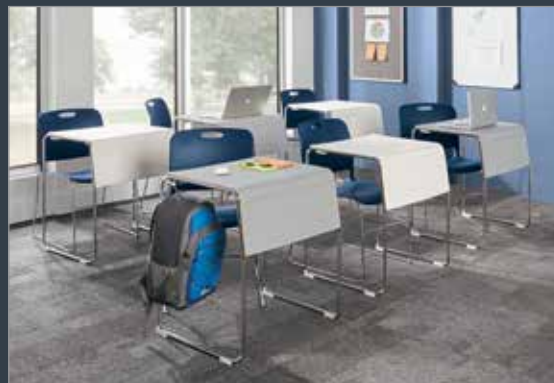
NBF Signature Series — Merge Desks, Zeus Chairs