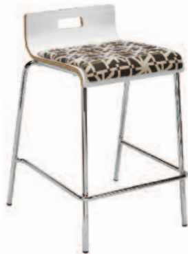
CT9333 Seat height - 25"