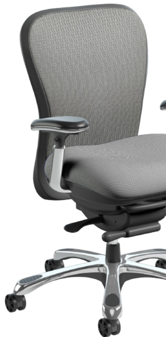
6200-CH-SM Upholstered Seat, Silver Mesh Back & Chrome Package. STRETCH COLLECTION MYSTIC | C2 | Gray