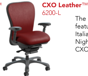
CXO Leather™ 6200-L

The CXO Leather™ has all the same extreme comfort features of the CXO™, but is wrapped in butter soft Italian made leather upholstery. Upholstered in either of Nightingale's Madras or Princess leather collections the CXO Leather™ combines comfort with class.