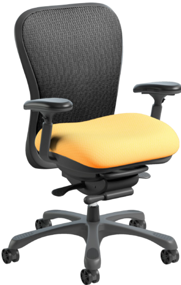
6200 Upholstered Seat & Black Mesh Back STRETCH COLLECTION BEEHAVE | BEE01 | Mustard

The CXO™ series can be upholstered using a wide range of our high quality stretch fabrics, vinyls or leathers in a range of colors and grades. To see them all rendered in real time visit Nightingale's My Chair Maker and make it your way: www.nightingalechairs.com/en/my-chair-maker .