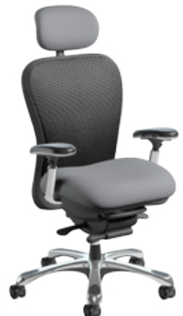
6200D-CH STRETCH COLLECTION BEEHAVE | BEE10 | Slate