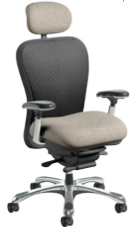
6200D-CH STRETCH COLLECTION MERIDIAN | MER007 | Cappuccino