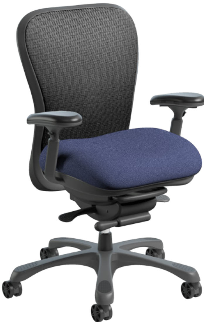
6200 Upholstered Seat & Black Mesh Back STRETCH COLLECTION MERIDIAN | MER002 | Monarch Blue