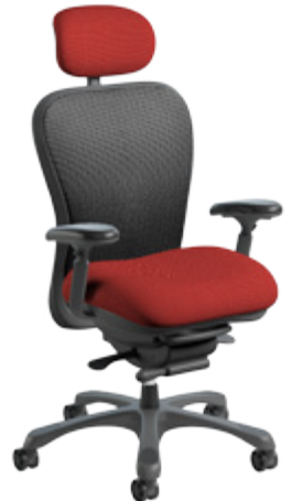
6200D STRETCH COLLECTION MYSTIC | C3 | Burgundy