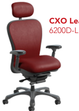
CXO Leather™ 6200D-L