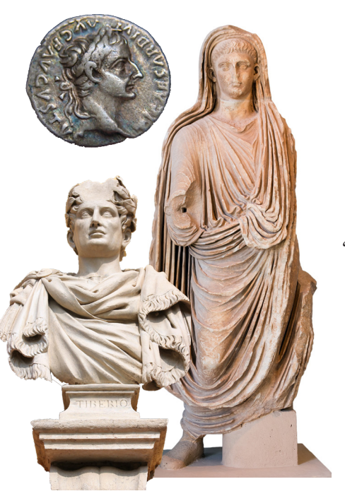
* Caesar Augustus

READ ABOUT THE DAY OF ATONEMENT IN LEVITICUS 16:2-4. How does this passage inform on the inappropriateness of Pompey's actions?