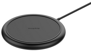
mophie Qi Universal Wireless ChargeStream Item: 8229446