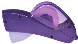
Baumgartens Trigger Squeeze Tape Dispenser Item: 197822