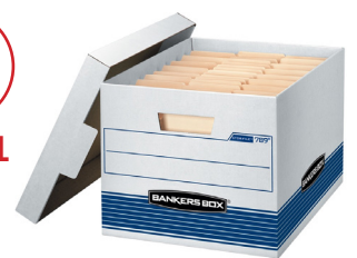
Bankers Box® Quick/Stor™ Boxes, 12/pk Item: 126019

Monthly specials are exclusive to members.