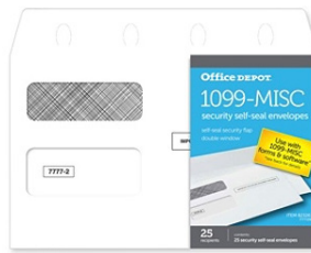
Double-Window Self-Seal Envelopes, 25/pk Item: 8232676