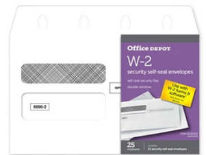
Double-Window Self-Seal Envelopes, 25/pk Item: 8230315