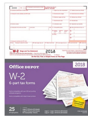
W-2 Inkjet/Laser Tax Forms, 25/pk Item: 8230088