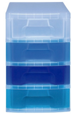
Really Useful Box® 4 Drawers Tower Item: 112613