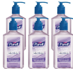
PURELL® Health Soap, Fresh Botanicals, 6/pk Item: 9733004