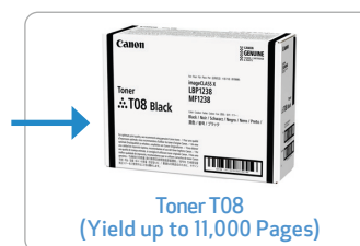
Toner T08 (Yield up to 11,000 Pages)

Use of Canon GENUINE toner cartridges helps provide longer equipment life, high yields, reliable performance, high-quality output, and minimal jamming or issues.