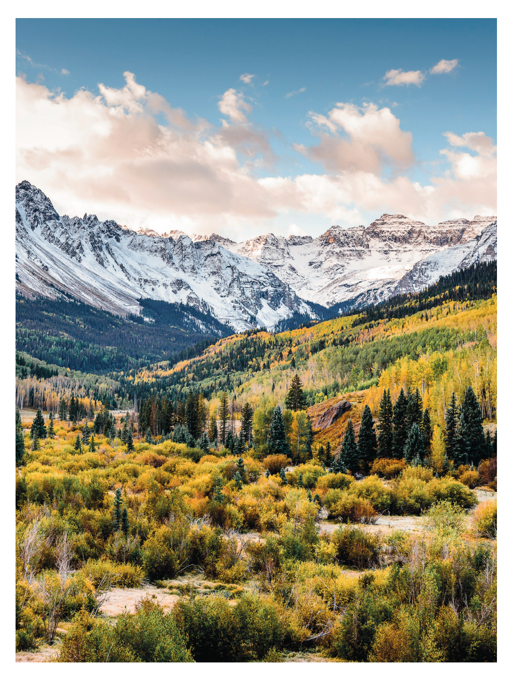
SESSION ONE | INTRODUCTION