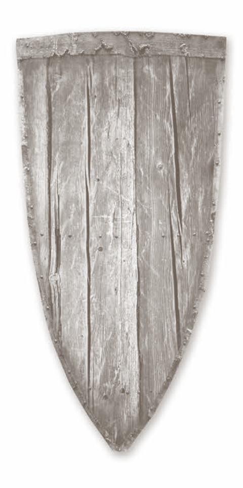
LifeWay Press® Nashville, Tennessee