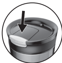
Snap down to seal.