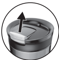
Snap up to drink with mug in upright position.