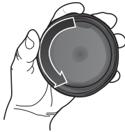
Twist to remove vitamin tray in storage lid