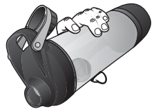
Ready to drink