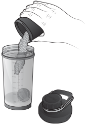
Pour in the powder

To use, insert your ingredients into the bottle with the shaker ball and shake according to drink manufacturer instructions. Make sure the lid is screwed on tightly before shaking. To use the storage container, place protein in container, vitamins in vitamin tray and twist to secure container to body. Container holds 2 servings of protein. The container, when empty, can also store the agitator ball.