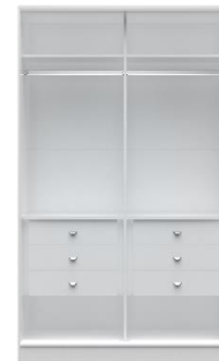
He/She Wardrobe * 2 Sizes