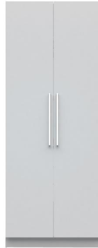
Double Pull Door * 3 Sizes