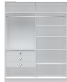
Full Wardrobe * 2 Sizes