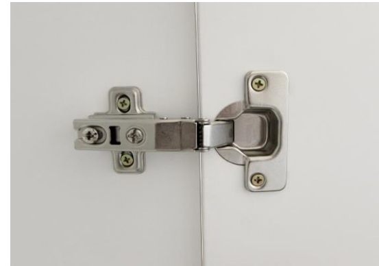
- Soft Close Door System - Easy Hinge Assembly