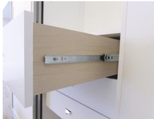
Full Extension Drawers