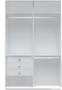
Basic Wardrobe * 2 Sizes