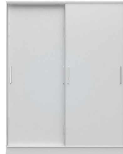
Double Sliding Door * 3 Sizes