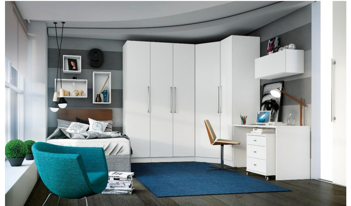
Closets with Doors Inspired by getting that room tidied up!