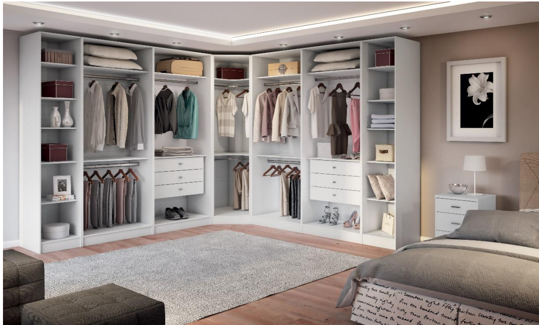
Open Closet System Inspired by Indoor Closet Systems!

A module wardrobe collection to fit all spaces with your choice of interior layout for organizational purposes.