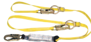
Part Number 10072473