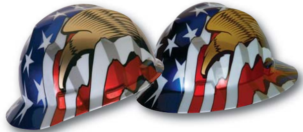
American Flag and 2 Eagles Cap and Hat