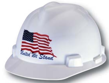
"United We Stand" Cap