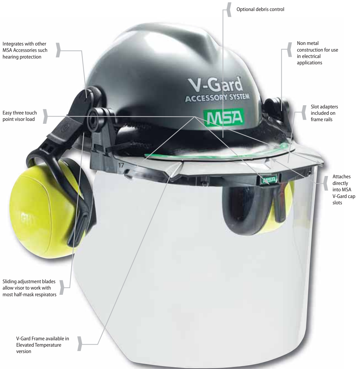
V-Gard Frame for Slotted Helmets, with debris control. Shown with clear polycarbonate visor and left/RIGHT (HIGH) earmuffs.