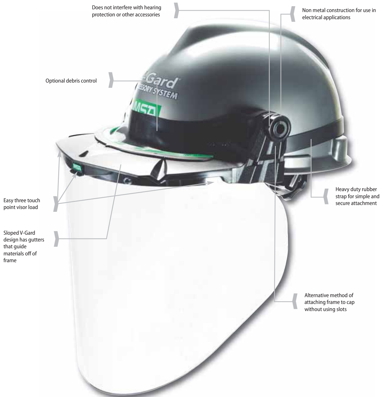
V-Gard Universal Frame for Non-Slotted or Slotted Helmets, with debris control. Shown with clear, moulded propionate visor.