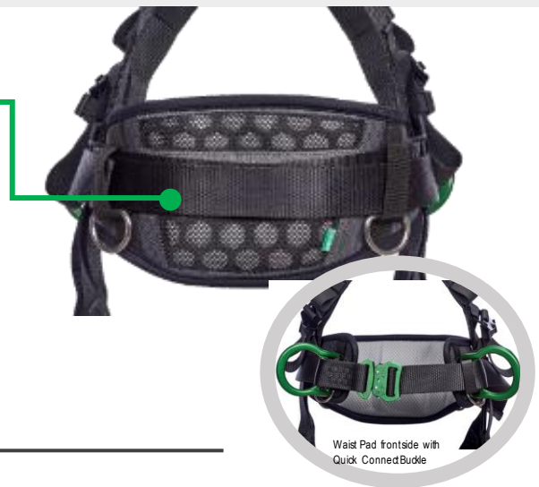
Waist Pad frontside with Quick Conned Buckle

The V-FIT Harness' adjustable waist pad allows you to position the waist pad specifically for you and your work day. With its patent pending design. The V-FIT waist pad can be adjusted higher on your torso for lumbar support or lower for work positioning applications. Designed around pressure points and by choosing breathable materials, the V-FIT waist pad delivers ultimate on-the-job comfort.