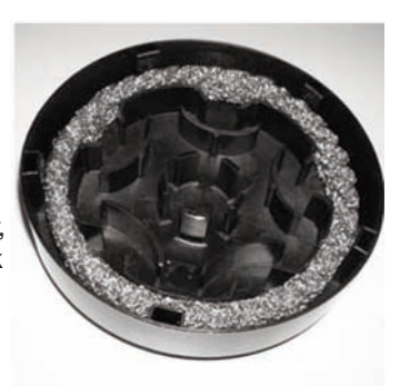
check for optional spark arresting material

5. To remove the spark cover, gently squeeze the outside of the cover, twist, and pull the spark cover off.