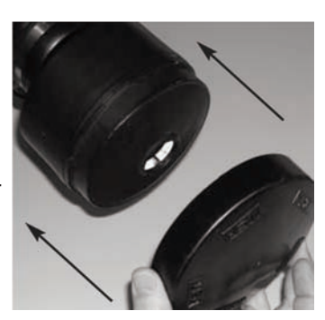
motion for attaching spark cover