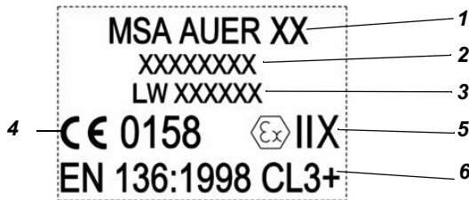
Fig. 2 Marking of mask body

The mask is marked on the outer face blank as shown in Fig. 2: