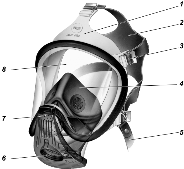
Fig. 1 Overview full face mask

The exhalation air passes through the exhalation valve directly to the ambient air.