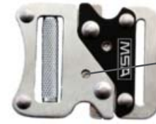
Positive Engagement Window