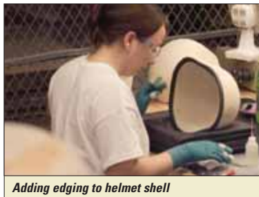
Adding edging to helmet shell