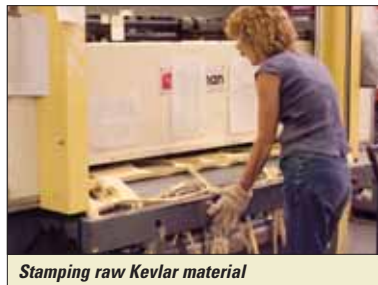
Stamping raw Kevlar material

But all this testing, more testing, upgrades, and technological changes are done for a simple reason—to ensure MSA is Protecting the Protectors in the best way possible! 🧢