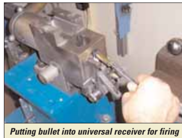
Putting bullet into universal receiver for firing

helmet design. "I was very happy for Sergeant Rich, and of course, those kinds of success stories are very good for MSA."