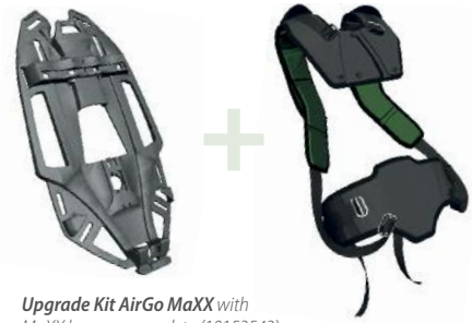
Upgrade Kit AirGo MaXX with MaXX harness, complete (10153543) MaXX harness, without hip belt (10164912)