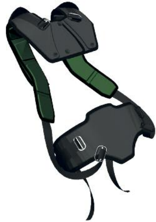
Shoulder Strap left, complete (10027673) Shoulder Strap right, complete (10027674) Hip Belt, complete (10027670)