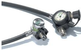
Pressure Reducer SL , without lines (10068765) Pressure Reducer SL-Q with QuickFill coupling, without lines (10068766)