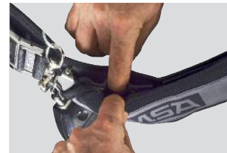
MaXX Protective Sleeves Set, black (10158776)