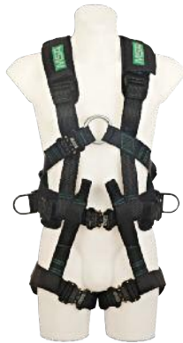
alphaFP pro, standard (10116541) alphaFP pro, large (10117573)