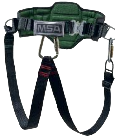
alphaBELT Pro Holding & Rescue Belt (10151246) alphaBELT Basic Holding Belt w/o Lanyard (10151241) alphaBELT Lanyard (10151242) Tri-Lock Carabiner, steel (10157585)