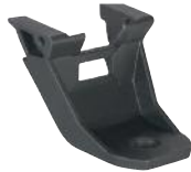
Valve Protection AirGo for 1 cylinder (10145942)