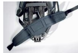
Swivelling Hip Pad Plate Upgrade, set for AirGo SCBA (10089276)