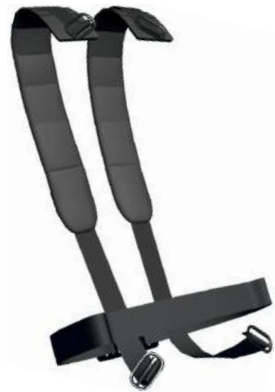
Shoulder Strap , complete (10089292) Hip Belt , complete (10089291)

The mix harness combines the basic hip belt from the compact harness with the padded shoulder straps from the pro harness.