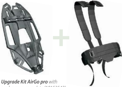
Upgrade Kit AirGo pro with pro harness, complete (10153542) pro harness, without hip belt (10164913)

To integrate the revolutionary alphaBELT rescue and holding belt from the beginning, both kits are also available without the standard hip belt.