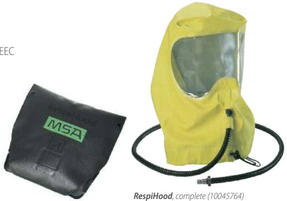
RespiHood, complete (10045764)