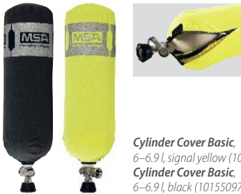
Cylinder Cover Basic, 6–6.9 l, signal yellow (10155098) Cylinder Cover Basic, 6–6.9 l, black (10155097)

Compressed air cylinders are designed to withstand most environmental hazards. However, they can lose operational safety through superficial damage and become unusable as a result. So, you should always ensure your cylinders are undamaged and clean when in use. Our protective covers made of non-flammable material meet all basic needs for the protection of your high-value composite cylinders. Beside the basic protection, the eXXtreme protective cover offers improved carrying comfort, with perfect visibility and durability, also for training exercises in hot conditions.