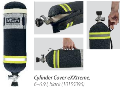
Cylinder Cover eXXtreme, 6–6.9 l, black (10155096)