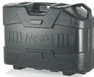
Carrying Case for SCBA, standard (10126797)