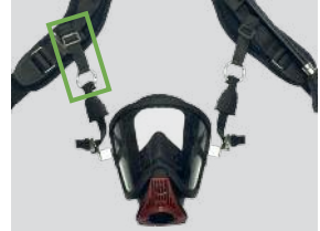
Helmet Mask Holder for SCBA, set (10164914)

These small holders allow to carry your mask with helmet adapters on your harness in front of your chest by simply hooking the adapters into the D-rings.