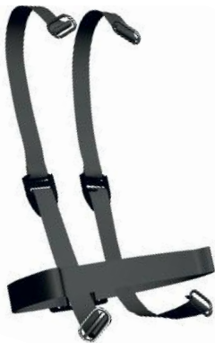
Shoulder Strap , one side, complete (10089280) Hip Belt , complete (10089291)

Intrinsically flame retardant polyamid straps provide reliable carrying strength and distribute weight between shoulders and hips.