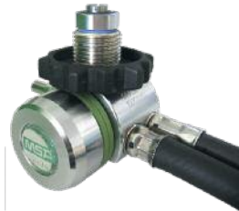
Pressure Reducer Classic , without lines (10068762)

The Classic pneumatic system uses individual lines for each function. One medium pressure line to supply the demand valve and a high pressure line with gauge come as standard.