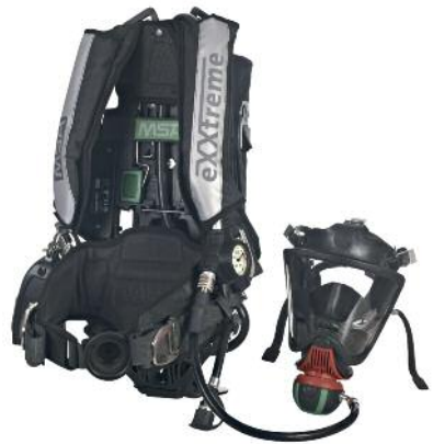
eXXtreme Upgrade Kit, black (10145843) (incl. stainless steel cylinder retaining clamp)