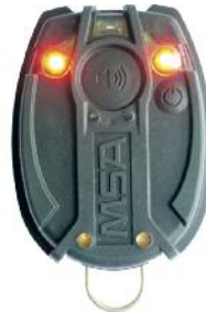
motionSCOUT (10088031) motionSCOUT K (10088032) motionSCOUT T (10088033) motionSCOUT K-T (10088034)

K: key version T: with temperature sensor