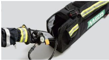
Bag for Rapid Intervention Team SL (10103749) Bag for Rapid Intervention Team SL long (10104597) Bag for Rapid Intervention Team SL-Q (10104598)