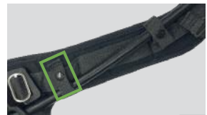
Line Holder, push-button (D4075832)

Our line holder with push-button keeps your hoses for air supply and pressure gauge safe and close to the shoulder straps of your SCBA harness.