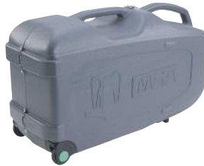
Carrying Case for all SCBA with 1 or 2 cylinders (10049021)