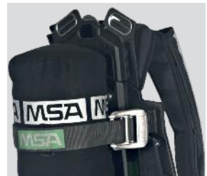
eXXtreme Cylinder Belt, complete (10040411)

To properly protect the important connection between cylinder and SCBA backplate, this cylinder strap is made of robust Kevlar with a patented steel buckle solution, ensuring long durability.