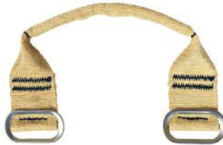
Rescue Handle for SCBA, pack of 4 (10152624)