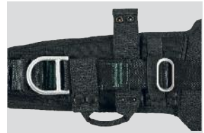
Small Connector Loop for SCBA belts (10151249)

Not only additional equipment must be approved, but also the attachment solution must be compatible with the harness. This small holder strap is approved for use with MSA SCBA.