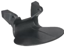
Valve Protection AirMaXX for 1 or 2 cylinders (10087372-SP)

Our protection for cylinder valves was designed to absorb both rough and direct impact. In case of an emergency it gives way, so that the user is not in danger of getting caught.