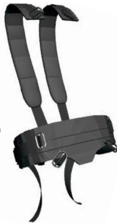
Shoulder Strap , complete (10089292) Hip Belt , complete (10089293)

Generously padded shoulder straps and hip belt ergonomically distribute SCBA load while providing lasting comfort. Extra secure fasteners are quickly donned and doffed. The hip strap is adjusted simply by pulling towards the front. The Nomex® blend material provides extra durability.