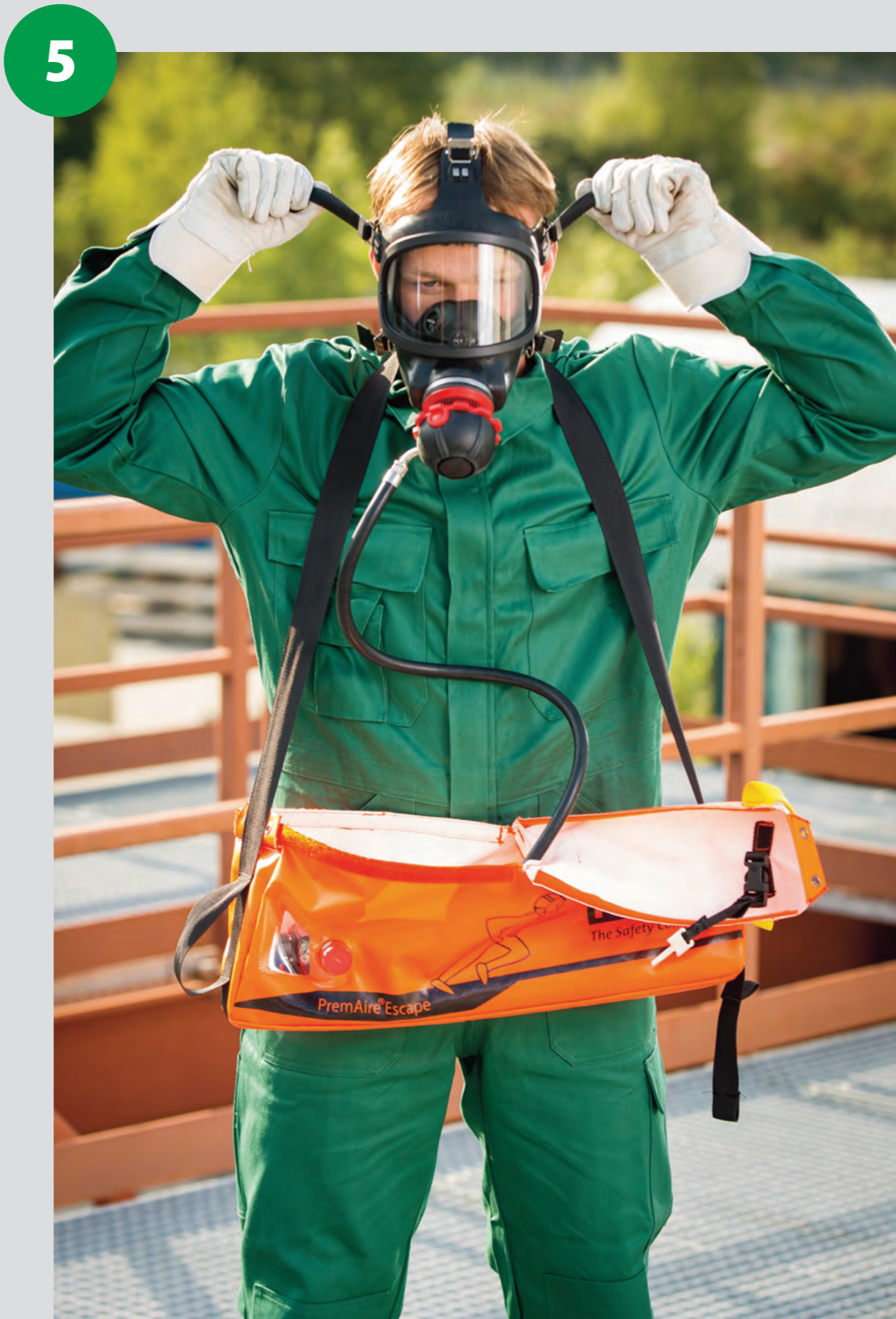
5 Quickly continue donning the full face mask and tighten the mask straps.