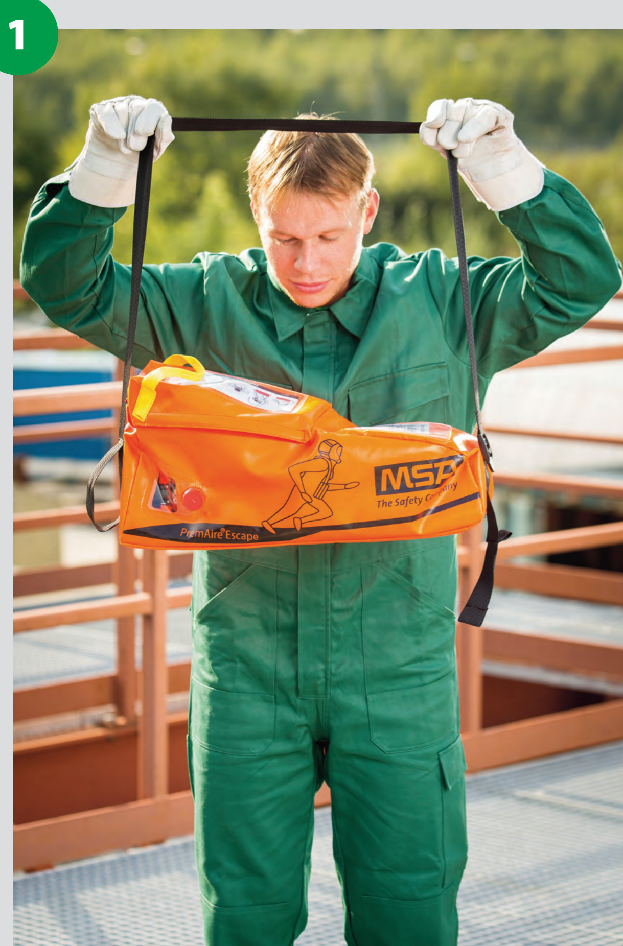
1 Place neck strap over head so that the filling connector points away from the body.