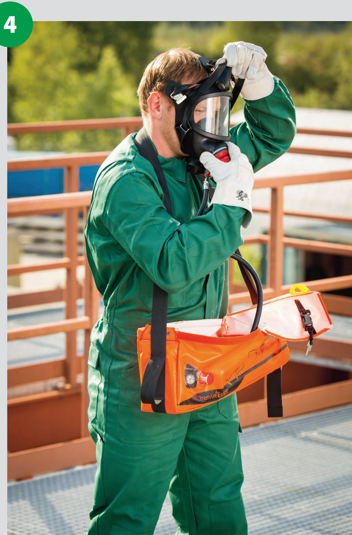
4 Press mask on face to create a tight face seal. Start breathing or push AutoMaXX flush button.