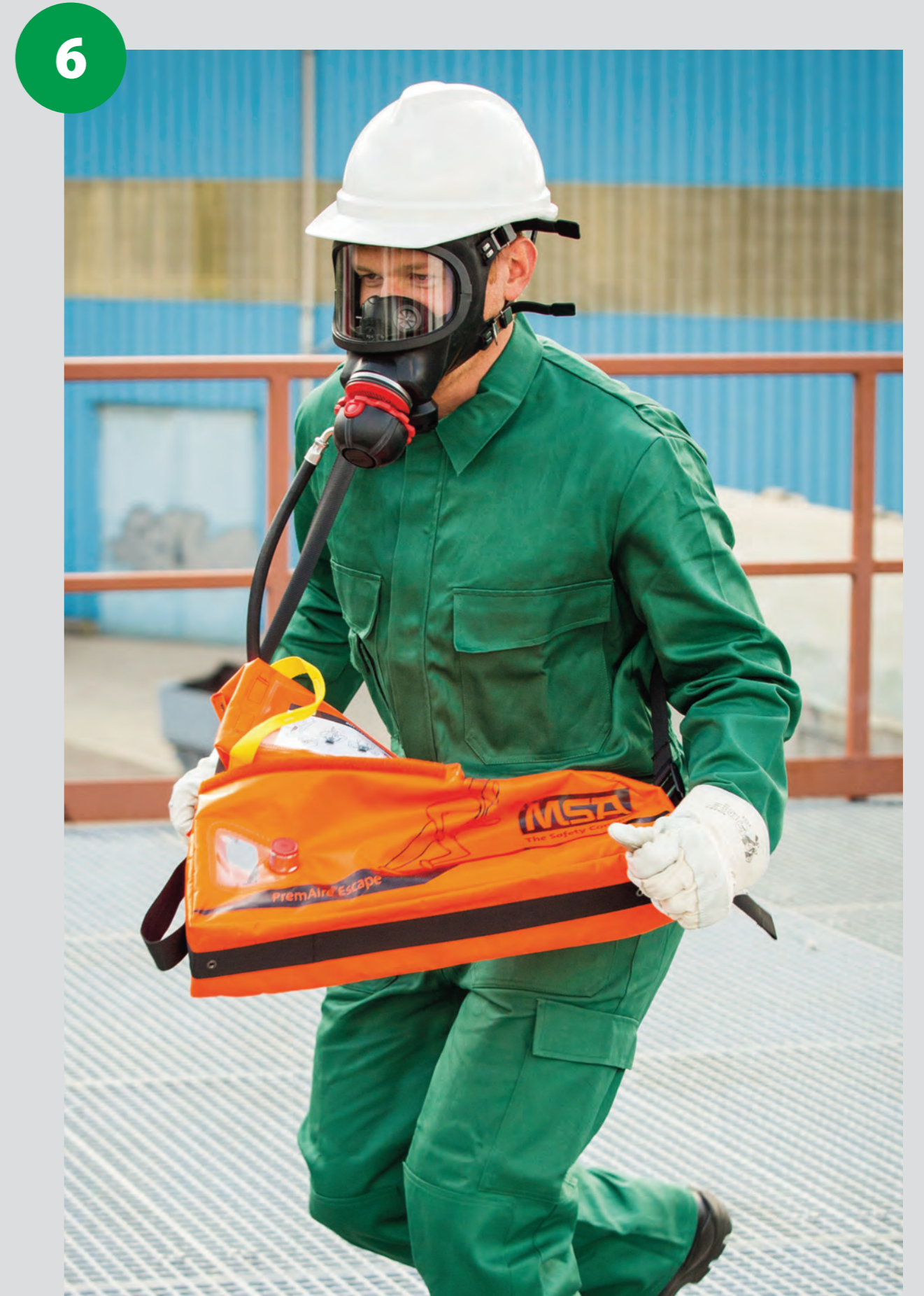
6 Escape immediately to non-hazardous area.