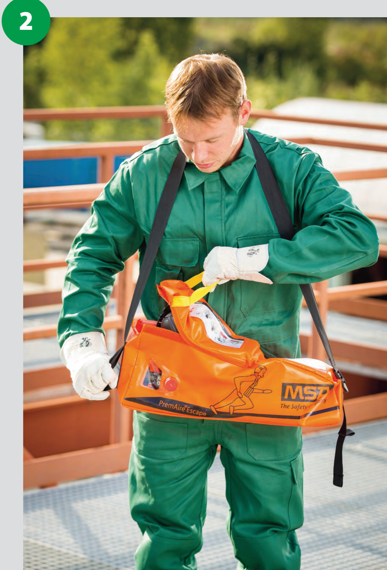
2 In case of emergency, pull up the lid to open the bag (starter key attached to the bag opening flap will automatically activate the pressure reducer).