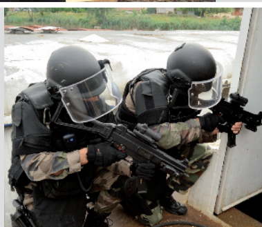
Hearing Protection and Communication