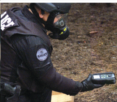
Mask Helmet Combinations