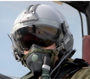
Helmets for jetfighters and helicopter pilots