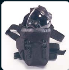
Gas Mask Pouch