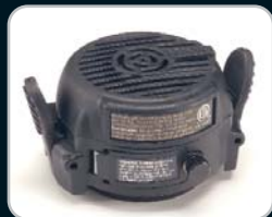
ESPII® Communications system