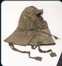
Butyl Coated Nylon Hood