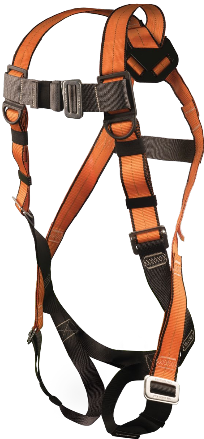
SUPERLIGHT Body Harness