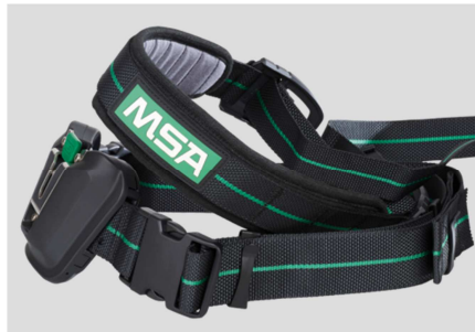
Hip Belt & Shoulder Harness Assembly