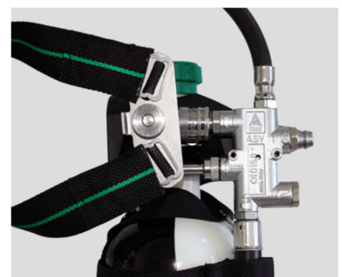
Automatic Switch Valve

Note: This bulletin contains only a general description of the products shown. While uses and performance capabilities are described, under no circumstances shall the products be used by untrained or unqualified individuals and not until the product instructions including any warnings or cautions provided have been thoroughly read and understood. Only they contain the complete and detailed information concerning proper use and care of these products.