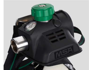
Cylinder Valve Hard Cover