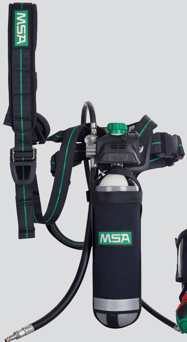
PremAire Combination with 3S-PS-MaXX and AutoMaXX-AS