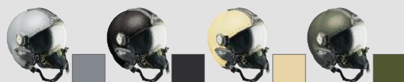
For other colours, please contact us.