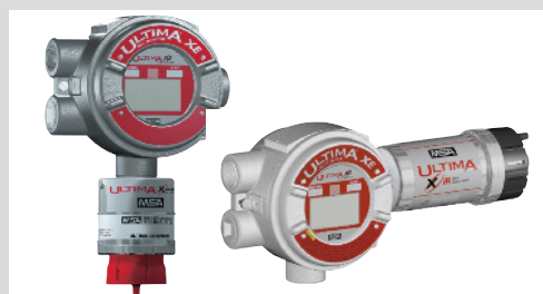
ULTIMA X Series