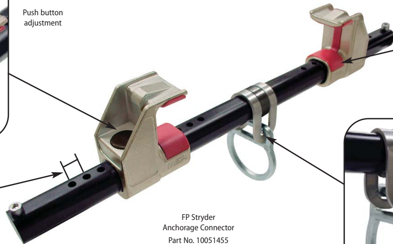
FP Stryder Anchorage Connector Part No. 10051455