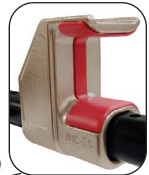
Glide Pads with Teflon