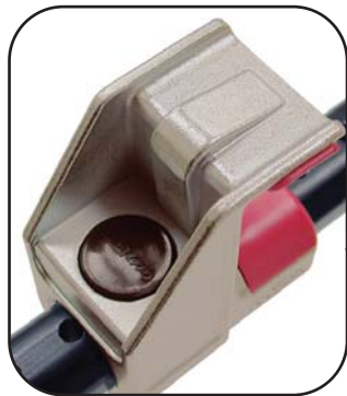
Push button adjustment