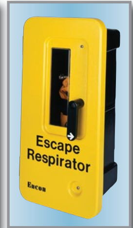
Two unit and single unit wall mounting case—chemical-resistant ABS plastic case resist weathering, moisture, and corrosion to ensure escape respirators stay in ready-to-use condition.

Note: This bulletin contains only a general description of the products shown. While uses and performance capabilities are described, under no circumstances shall the products be used by untrained or unqualified individuals and not until the product instructions including any warnings or cautions provided have been thoroughly read and understood. Only they contain the complete and detailed information concerning proper use and care of these products.