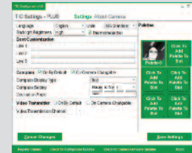
Camera configuration application