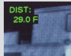
Laser range finder