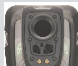
Field-replaceable germanium lens