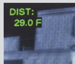
Laser range finder