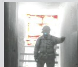
Colourized basic image