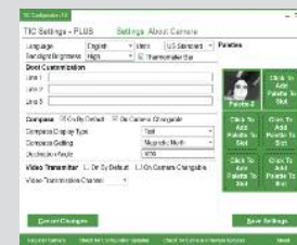
Camera configuration application