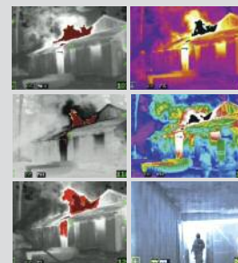
Six color palettes