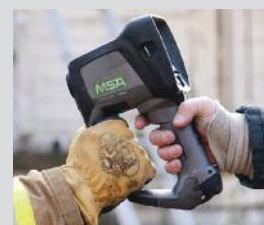
Patented dual-handle design