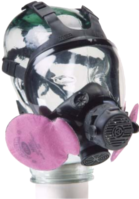
The Advantage® 1000 Respirator with the ESP® II Communication System