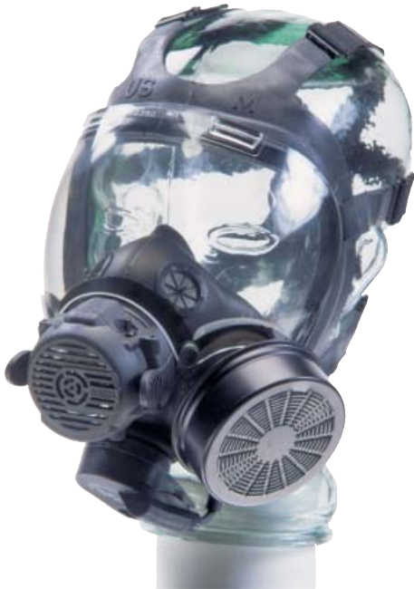
The Millennium® Chemical-Biological Mask with the ESP® II Communication System

Designed for use with the Advantage 1000 Respirators and the Millennium Chemical-Biological Mask, the ESP II Communications System is a self-contained electronic speech projection device. The compact, battery-operated unit clearly amplifies and projects the wearer's voice, allowing ungarbled speech to be heard, even in areas with high ambient noise.