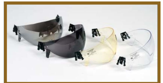
Four available visor shades

Note: This Bulletin contains only a general description of the products shown. While uses and performance capabilities are described, under no circumstances shall the products be used by untrained or unqualified individuals and not until the product instructions including any warnings or cautions provided have been thoroughly read and understood. Only they contain the complete and detailed information concerning proper use and care of these products.