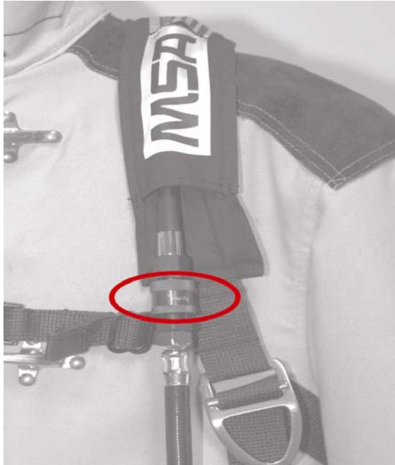
Fig. 1 Hose With Quick-Connect Retrofit Required