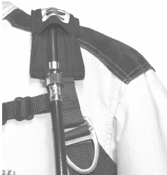
Fig. 3 Hose With Threaded Connection No Retrofit Required