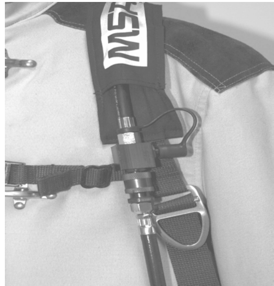
Fig. 4 Hose With Extend-Aire System And Threaded Connection No Retrofit Required