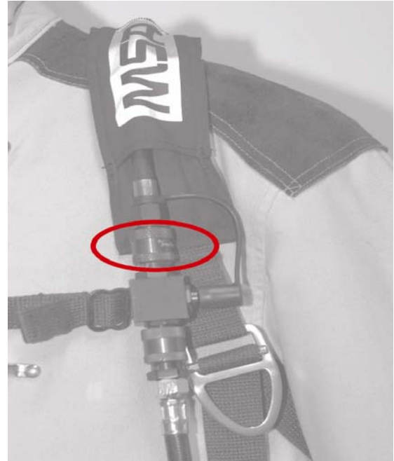
Fig. 2 Hose With Extend-Aire System and Quick-Connect Retrofit Required