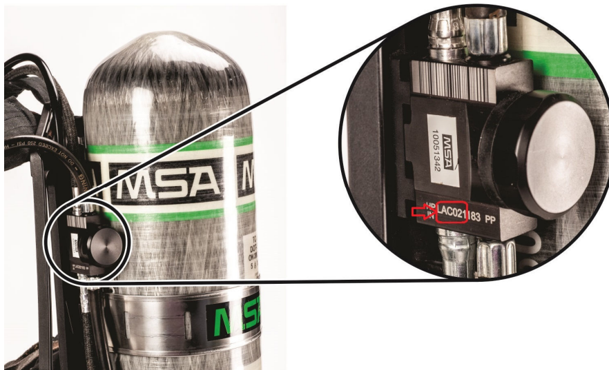
Air Mask Serial Number Location – Refer to First Six Digits

Refer to the photos below to locate the first stage regulator serial number.