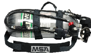
RescueAire II System