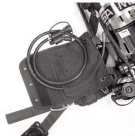
ExtendAire II System