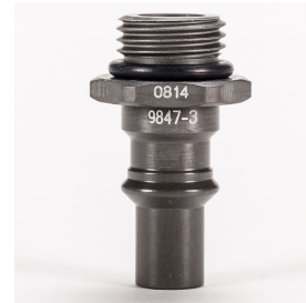
New Male Quick Connect Fitting

Again, we apologize for any inconvenience that this situation may cause; however, your safety and continued satisfaction with our products is most important to us.