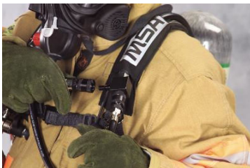
ExtendAire I System

We received three reports indicating that, during training exercises, the intended recipient of air did not receive air after a secure connection was made to the donor's tee manifold of an ExtendAire I equipped Air Mask. The donor continued to receive air.