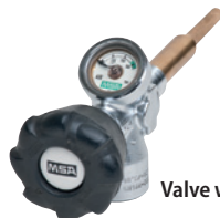
Valve with Gauge