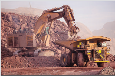
Industrial Vehicle Maintenance