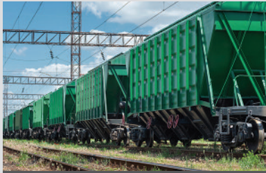
Rolling Stock Access

Other applications where WinGrip can provide portable anchorage benefits: