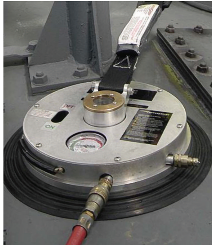
WinGrip Single-User System anchored to transformer

The system is comprised of a ground-based vacuum module, portable vacuum pad and durable connection hose.