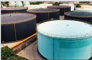
Storage Tank Maintenance