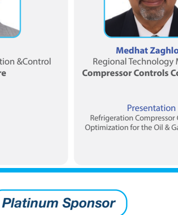
Team Leader - Instrumentation & Control