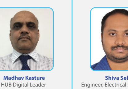
Business Leader Network Security Services Rockwell Automation Presentation

11.00 am - 12.30 pm IIOT "Industrial Internet Of Things"