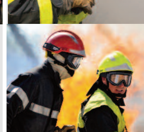
Helmets for forest fire and rescue missions