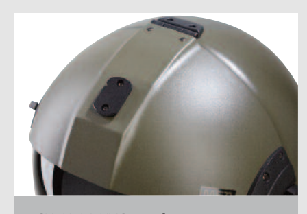
• CN2H-AA NVG interfaces