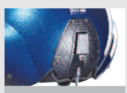
• Centralization of power supply and audio functions