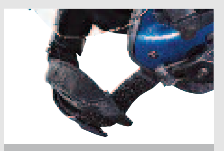
• Flexible, ergonomic and comfortable retention system