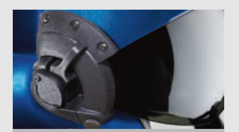
• Inner visor adjustment with right lever