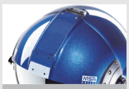
• ANVIS NVG interfaces