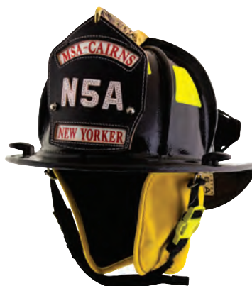
N5A Helmet with Bronx Bend

Some firefighters try to create the Bronx Bend by heating or steaming their leather helmets and then bending the brim downward. MSA has always maintained that altering an MSA Cairns Fire Helmet in any way, including molding the brim, will void the warranty. More importantly, making such alterations could cause the helmet to fail when it's needed most.