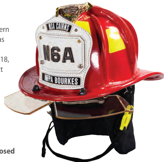
N6A Helmet with NFPA-compliant Bourkes

MSA takes this statistic seriously. Now, every MSA Cairns Leather Fire Helmet ordered through Assemble-to-Order (ATO) after August 1, 2018 3 will offer only removable, washable soft goods. Plus, for a limited time, every MSA Cairns Leather Fire Helmet will also ship with a FREE mesh laundering bag. There are three options available on the ATO: yellow nomex, black nomex or PBI/Kevlar (Moisture Barrier) ear cover. Additionally, each of these soft goods is available as a kit, complete with a laundering bag. 3 Order an extra set so you can always have a clean one!