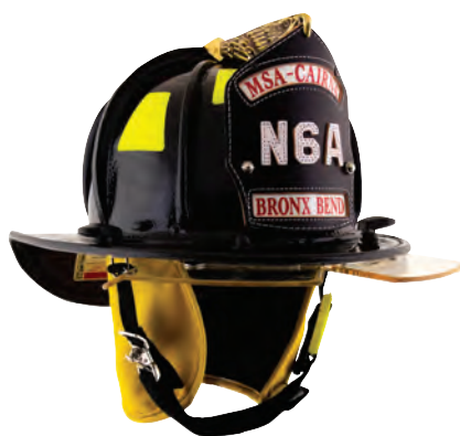
N6A Helmet with NFPA-compliant Bourkes and Bronx Bend

Don't take a chance on ruining your fire helmet and voiding the warranty ... if you want your fire helmet brim bent, order your MSA Cairns Leather Fire Helmet with a Bronx Bend!