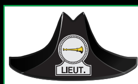
XF1 Front Plate, Lieut. w/1 trumpet (GA1150-N4)