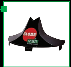
CUSTOMIZED FRONT PLATE