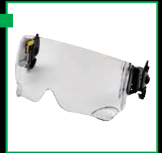
INTEGRATED OCULAR VISOR